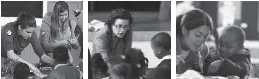
Photos from BMagic 2010 Book Fair.